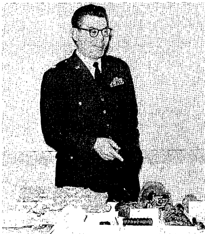
Maj. Quintanella and Hoax Exhibits

There are further signs that the AF is throwing caution to the winds. In an attempt to stop publicity about recently increased sightings, Maj. Hector Quintanella, head of Project Blue Book, was hurriedly ordered on a debunking tour. At press conferences, Quintanella concentrated on frauds, setting up the exhibits shown in the accompanying picture. This display included false UFO photos and fake "UFO debris" allegedly found where UFOs landed, or reportedly given witnesses by spacemen. When newsmen asked about the solid, documented reports by competent witnesses, Quintanella quickly brushed them off.